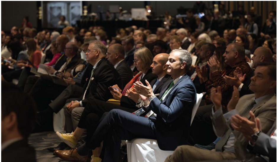
APK 2022 Singapore, Raffles City Convention Centre ▼