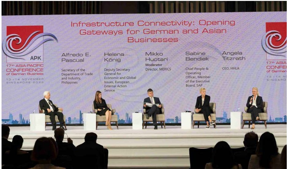
▲ Panel: Infrastructure Connectivity: Opening Gateways for German and Asian Businesses